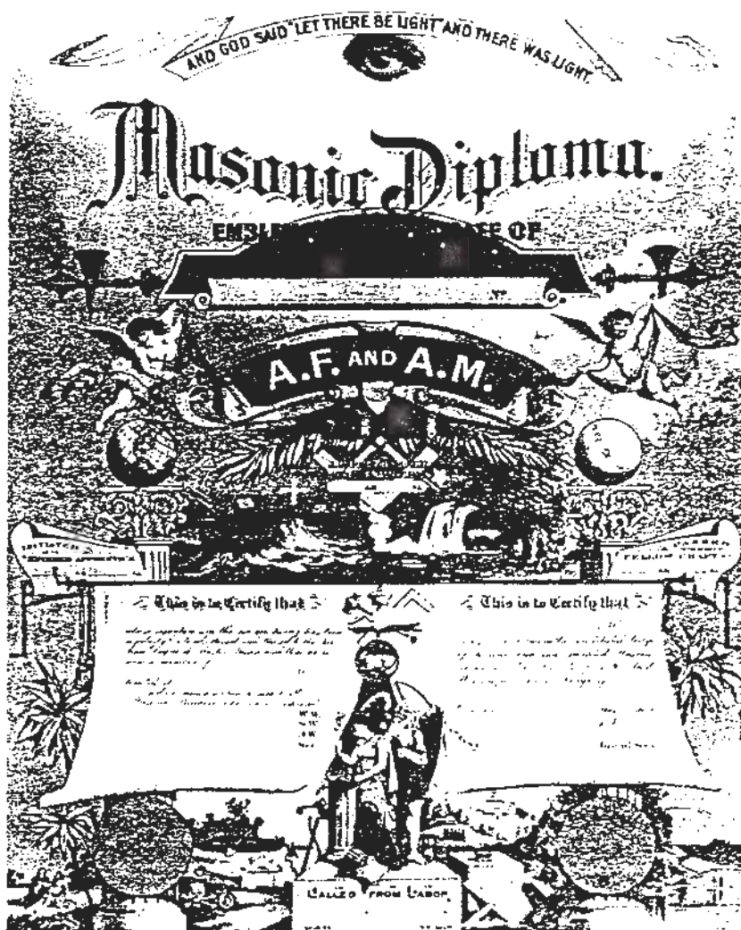
A Masonic diploma, recording the dates of the first three degrees. In five places, the dates are specified in both A.D. and A.L., or "Anno Lucis."

Crucis, also known as the Rose-Croix, the Red-Cross, or "the Rosicrucians," 45 Masons symbolically drape the lodge room in black and sit on the floor in silence resting their heads in their arms in mock grief around