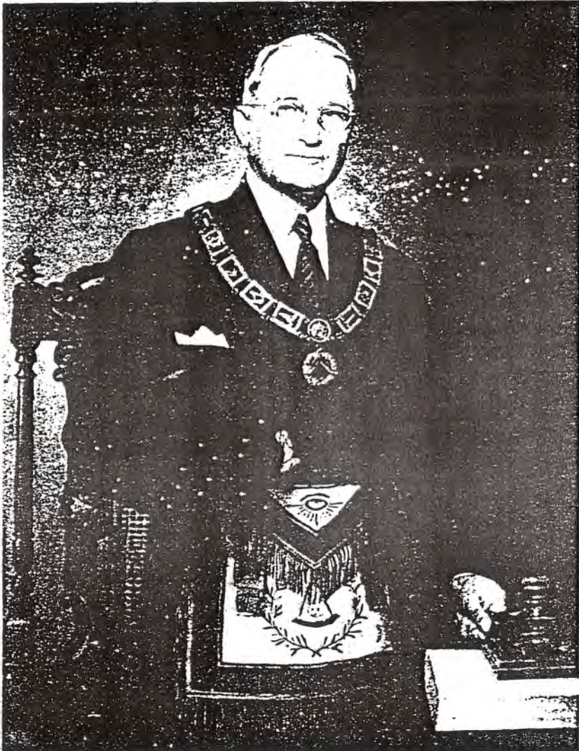
President Harry S. Truman in Masonic Apron