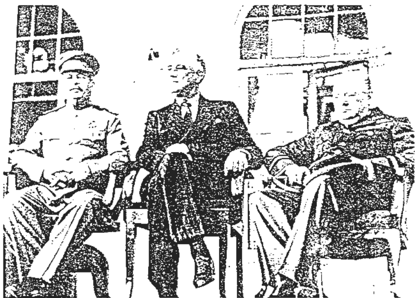
Stalin, Roosevelt & Churchill: all three were Masons

the acquisition of half of Europe by the Soviets was formalized by treaty after World War II, who was Roosevelt's top advisor? Alger Hiss, a member of the Council on Foreign Relations who was later convicted of espionage as a Soviet spy. 36